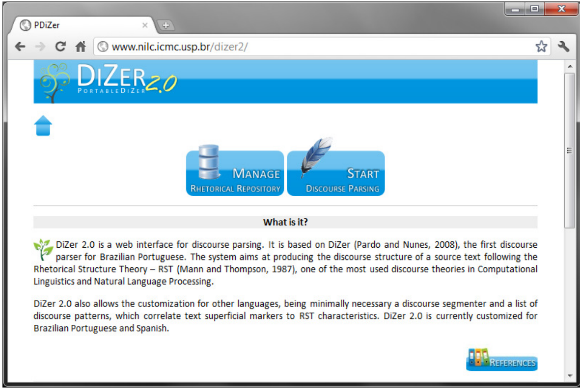
Figure 2 – DiZer 2.0 initial screen dump

Text segmentation may be manually or automatically performed, according to the user desire. If the user decides for the manual segmentation, the system will offer him a text box where the text must be inserted and segmented. To indicate the segments, the user must put each segment in a new line and, when sentences and paragraphs boundaries are found, they must be indicated by the [s] and [p] marks, respectively.